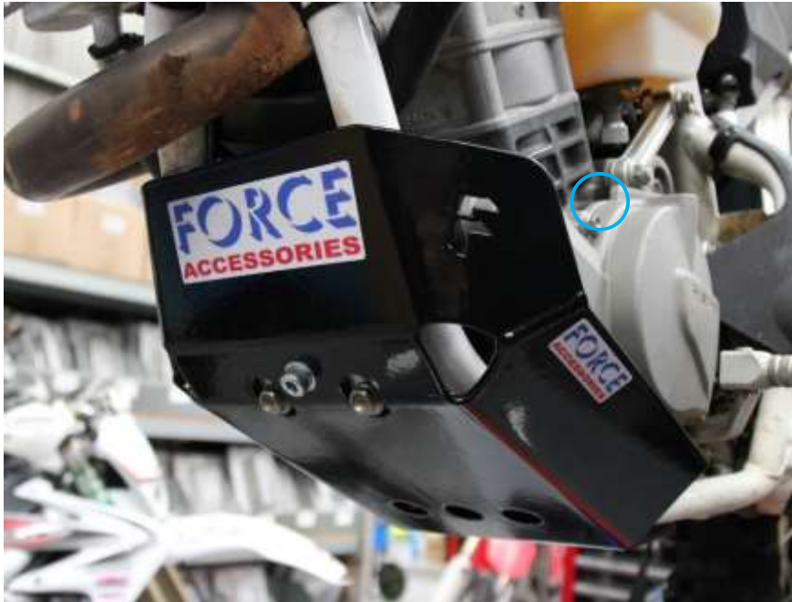
Figure 3 - Mounted Bashplate