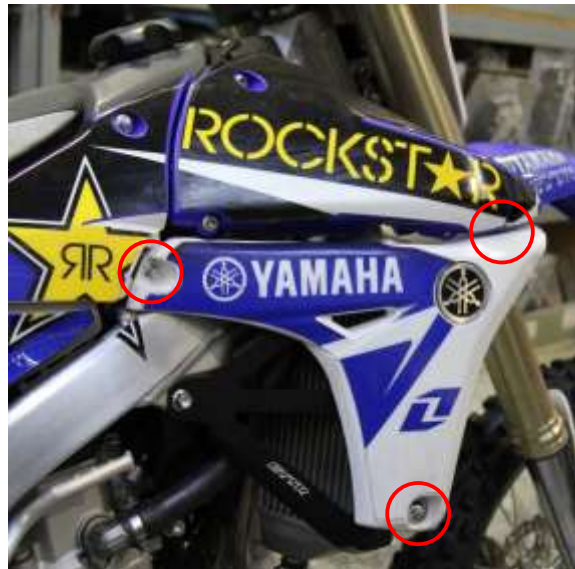
Figure 1: Mounting bolts for the lower radiator shrouds