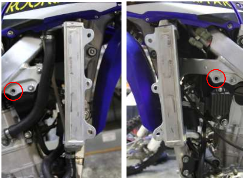
Figure 2: Radiator shrouds and engine mount bolts removed