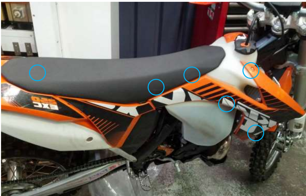
Figure 1: Mounting bolts for the seat, fairings and radiator shrouds