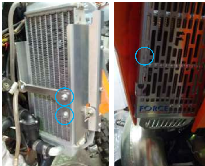
Figure 3: Fitting rear bracket and horn