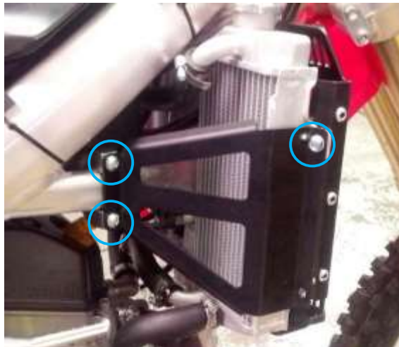
Figure 3: Fitting radiator braces