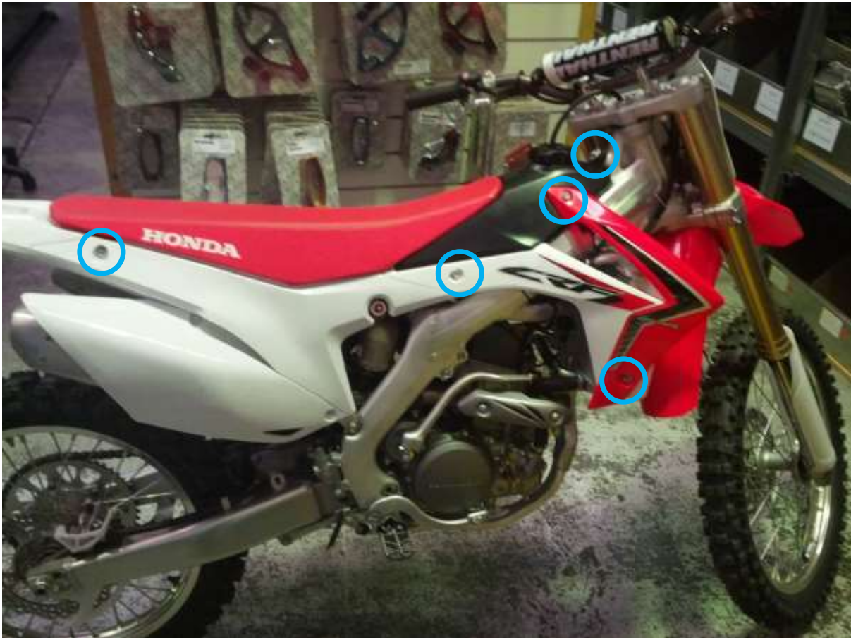
Figure 1: Mounting bolts for the seat, fairings and fuel tank